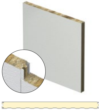
THERMSAFE® SANTA FE PANEL